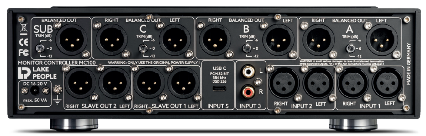
The MC100's rear panel is a jack-free zone!

I press Solo L and Mono at the same time is for a mono sum of both channels to appear only on the left speaker output. What actually happens is that the soloed left input channel appears on both speaker outputs. The ability to audition a mix in mono over a single speaker is very useful: the ability to audition one channel on both speakers, less so.