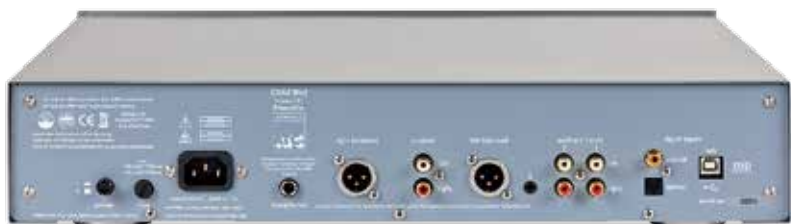
ABOVE: Digital inputs are covered by DSD-compatible USB-B and S/PDIF on coax and Toslink optical, with two sets of line-level analogue inputs on RCAs, alongside a 6.35mm headphone socket, balanced (XLR) and single-ended (RCA) preamp outputs

amazing how its 'nothingness' can prove highly addictive! You could pay a lot more for a CD player, DAC and preamp and still find the components imposing something of themselves on the sound. That this (relatively) affordable combination offers so much and yet adds or removes so little is a major achievement by ATC's engineers.